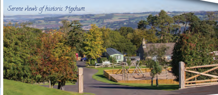
Serene views of historic Hexham