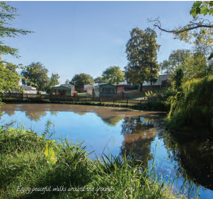
Enjoy peaceful walks around the grounds