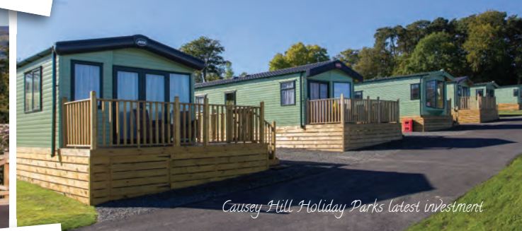
Causey Hill Holiday Parks latest investment

NOW AVAILABLE At Causey Hill Holiday Parks new development