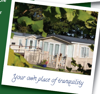
Your own place of tranquility