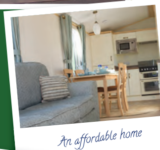
An affordable home