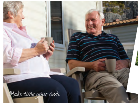
Make time your own