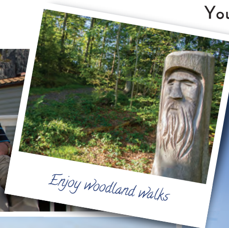
Enjoy woodland walks